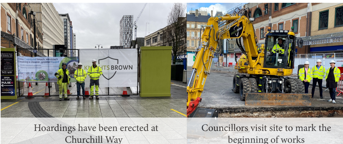
Hoardings have been erected at Churchill Way

Adam Street junction will near completion with a new pedestrian crossing in place and a new shorter central splitter island.